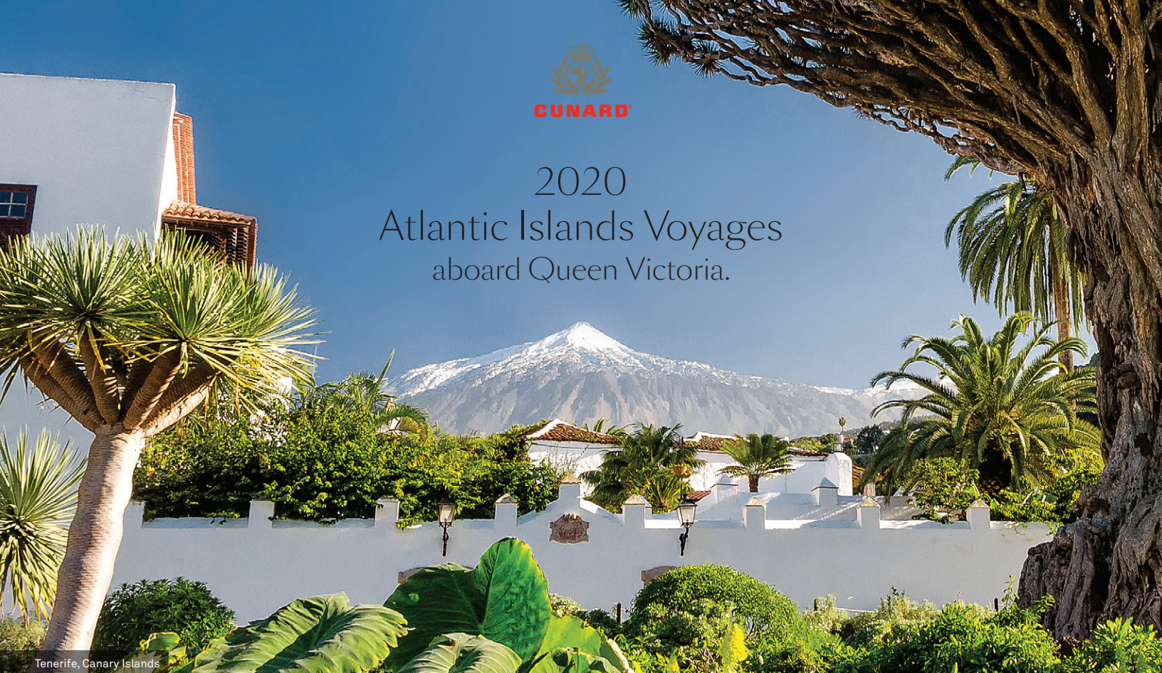
Tenerife, Canary Islands

Bask in warm year-round temperatures as you marvel at spectacular landscapes off the northwest coast of Africa. Black-sand beaches, mystifying cloud forests and towering sand dunes invite discovery, and all these intriguing islands are perfect to explore from the luxury of a Cunard® ship.